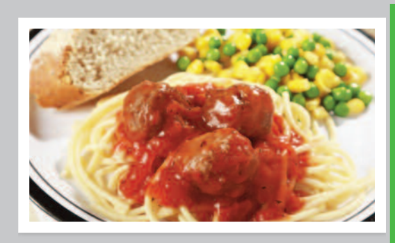
Meatballs in Tomato Sauce served with Spaghetti, Garlic & Herb Bread and Seasonal Vegetables