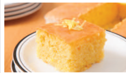
Lemon Drizzle Cake