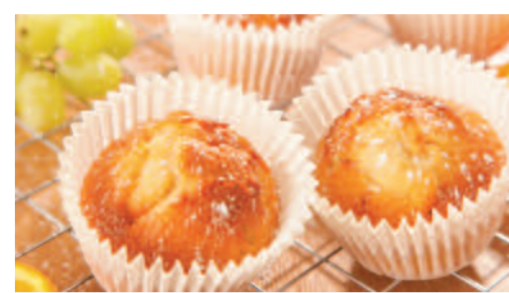
Apple & Cinnamon Muffin