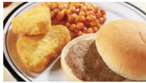
Sausage Pattie in a Bun, Hash Browns and Baked Beans