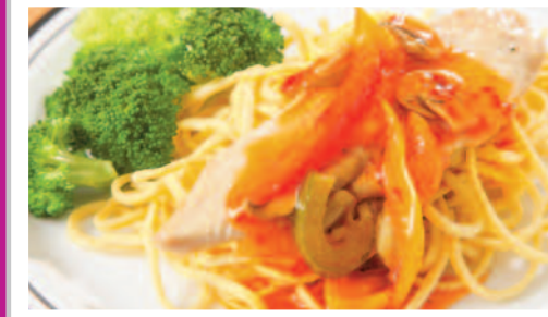
Sweet Chilli Chicken served with Noodles & Seasonal Vegetables