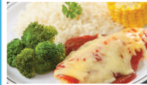
BBQ Chicken served with Savoury Rice and Seasonal Vegetables