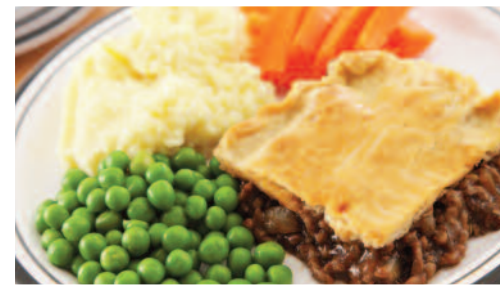
Homemade Mince Beef Pie served with Mashed Potatoes & Seasonal Vegetables