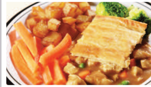
Homemade Chicken Pie served with Diced Crispy Potatoes & Seasonal Vegetables