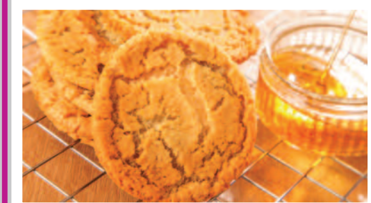
Golden Crunch Cookie

AVAILABLE EVERY DAY – UNLIMITED SALAD, FRESHLY BAKED BREAD, FRUIT YOGHURT & FRESH FRUIT PLATTER. FOR ALLERGEN INFORMATION, PLEASE ASK ONE OF OUR CATERING TEAM. ALL THE ABOVE DISHES ARE SUBJECT TO AVAILABILITY.