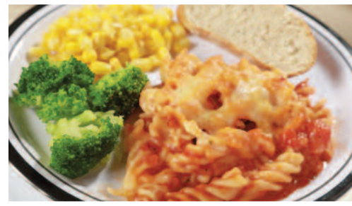
Cheese & Tomato Pasta served with Garlic & Herb Bread and Seasonal Vegetables