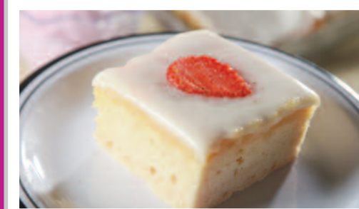
Strawberry Ice Cream Cake