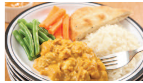
Chicken Korma served with Rice, Naan Bread & Seasonal Vegetables