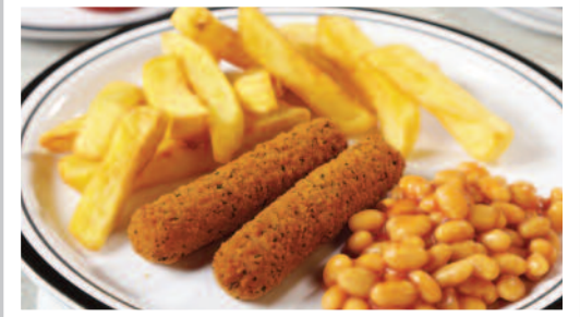
Breaded Mozzarella Sticks served with Chips & Peas or Baked Beans