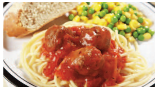
Meatballs in Tomato Sauce served with Spaghetti, Garlic & Herb Bread and Seasonal Vegetables