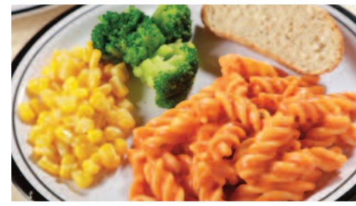
Tomato & Mascarpone Cheese Pasta served with Garlic & Herb Bread and Seasonal Vegetables